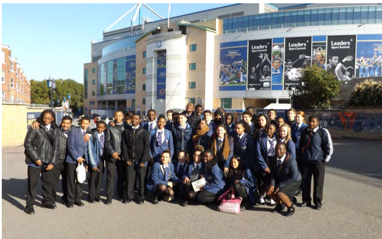
Year 11 pupils outside Chelsea Football Club

The collective feedback from the pupils was very positive. Overall they deemed the visit entertaining, engaging and found the opportunity of asking the tour guide a range of questions intriguing. Academically, the pupils were provided with countless opportunities to consolidate prior GCSE learning and display any new theoretical content they had learnt in a setting that would help with long term attainment.