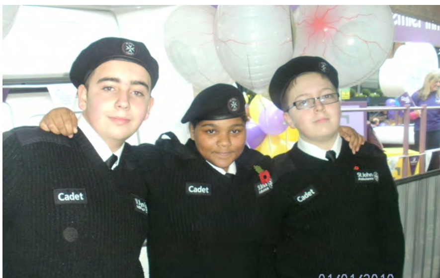
SJA Cadets on the St. John Float at the Lord Mayor's Show

The pupils had a wonderful time and enjoyed their moment of fame (they were on TV) and are looking forward to participating in the Lord Mayor's Show in the future.