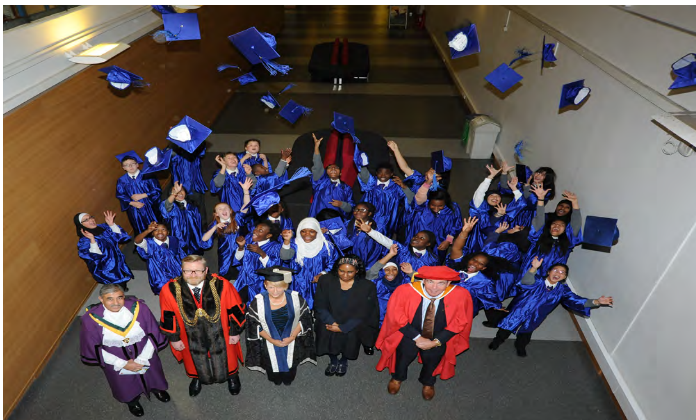
Platanos pupils celebrate with the Mayors of Southwark and Lambeth, the Pro Vice Chancellor of London South Bank University, and the manager and CEO of Children's University.