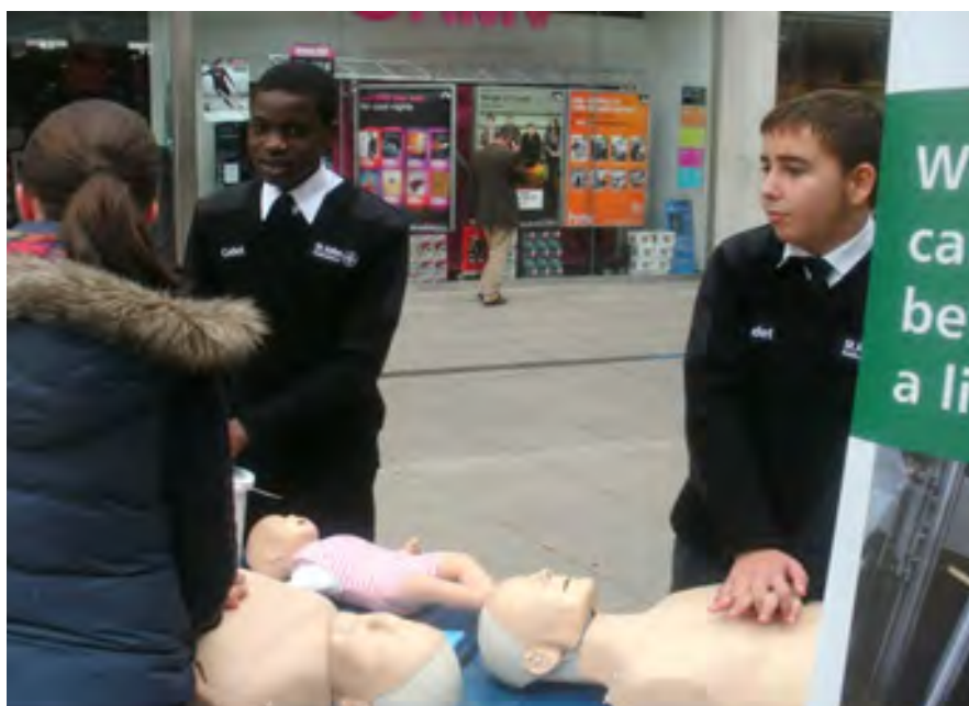
SJA Cadets giving public demonstrations

Our St. John Ambulance Cadets were out on duty teaching the public life saving first aid basics, as part of the St. John Ambulance Save a Life September campaign. Shoppers at Tesco Kennington and the N1 Centre in Islington were extremely impressed with the cadets' first aid knowledge and demonstrations. The cadets also did an outstanding job of raising £415.80 for the organisation which will go towards further training and resources.