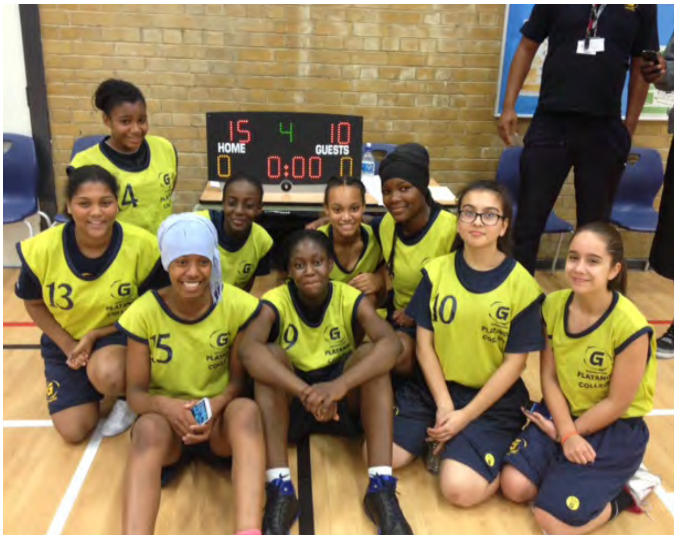
Platanos Under 16 Girls Team - League Champions

During the first half of term our Under-16 Girls Basketball team at Platanos have been competing in the Lambeth League as part of the London Youth Games and National Schools Competitions.