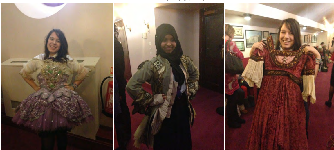
Pupils put on costumes