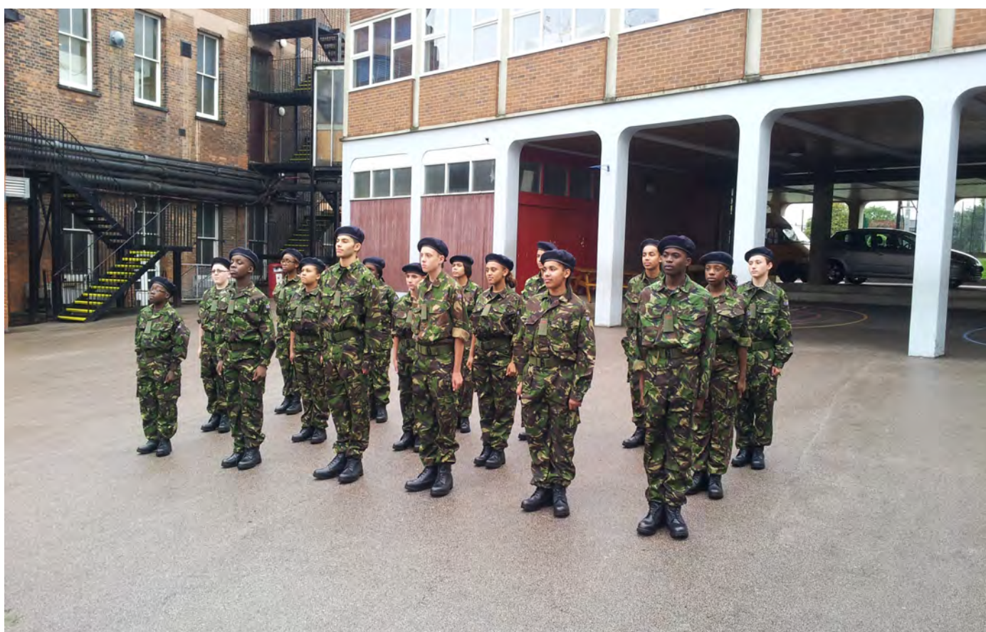
Platanos College Cadets on their first day

Young people are taught how to work together as groups within the community, encouraging them to become responsible young adults and learn valuable personal skills which are recognised by future employers. They will also have the opportunity to attend several residential trips.