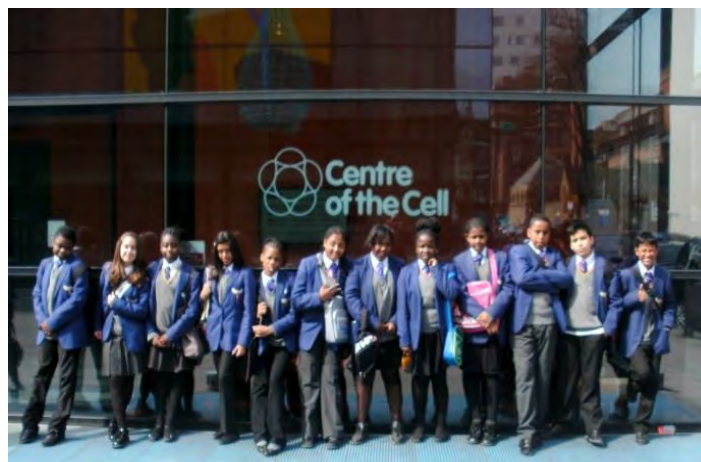
The Centre of the Cell