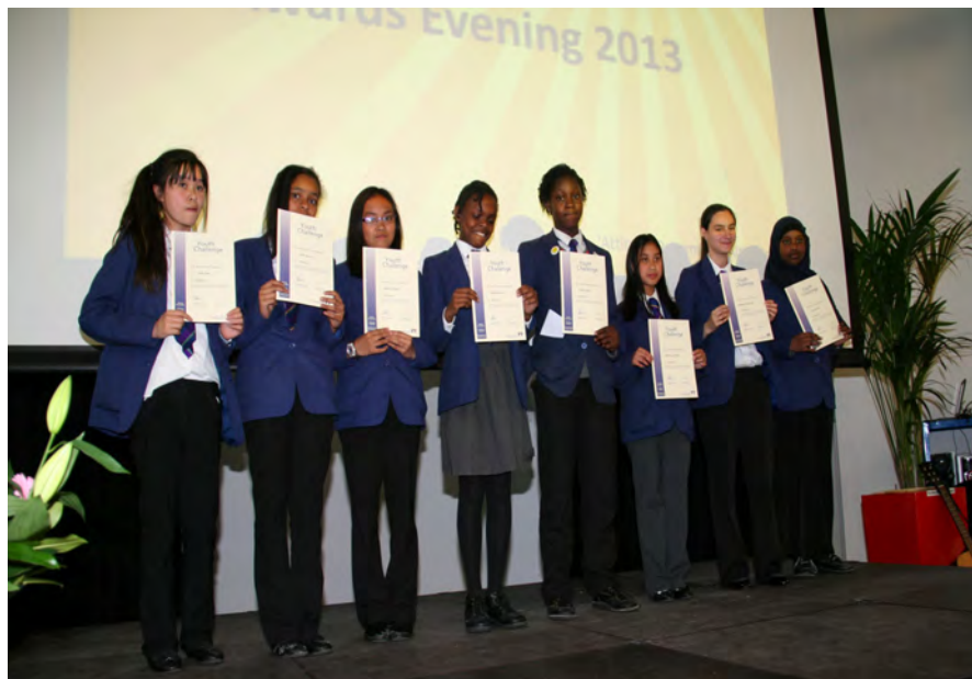
Youth Achievement Award winners

The Youth Achievement Awards (YAA) were launched at the school earlier this year.