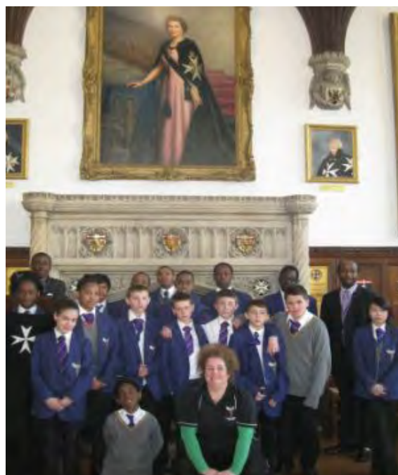
Pupils at St. John Museum

"I am now more aware of what to do in real life scenarios and now I need to be responsible for my actions as a qualified first aider."