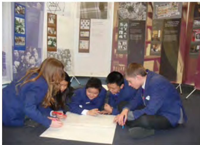
Ambassadors delivering a session to Yr.7 pupils

It has been an action packed year for the Anne Frank Ambassadors at Platanos College.