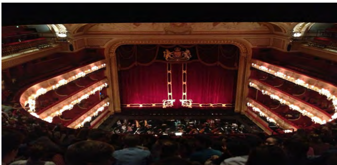
A Perfect view

The trip involved a question and answer session with professional ballerinas, watching rehearsals and the costume preparation backstage and understanding the management of such a large production.