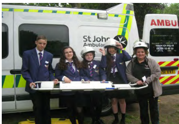
Pupils with a St. John Ambulance

We believe in preparing our pupils and giving them a range of skills for their future. It has been a great year for the First Aid Initiative across all year groups at Platanos College.