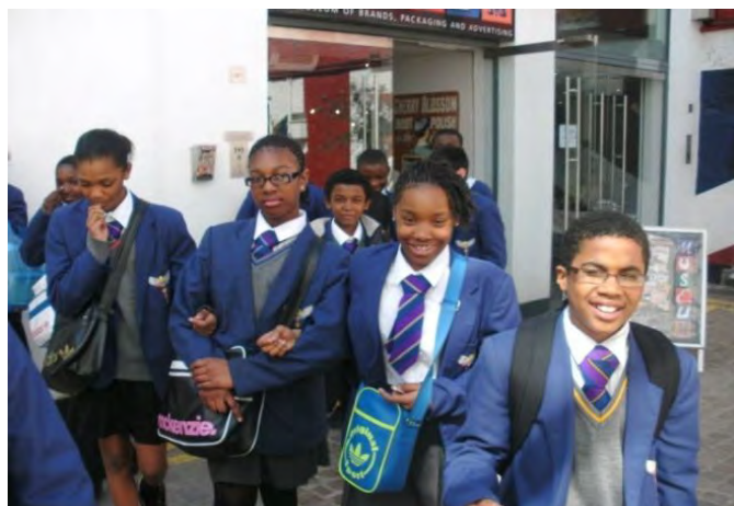
Museum of Brands and Marketing

An extended programme of educational visits took place over the year to enhance the learning of pupils at Platanos College. These included trips to museums (Science Museum, Design Museum, St. John Museum, Tate Modern, amongst others), the Greenwich Planetarium, Royal Courts of Justice, Centre of the Cell, the Royal Air Force (RAF) base in Brize Norton, residential trips to Barcelona and many others.