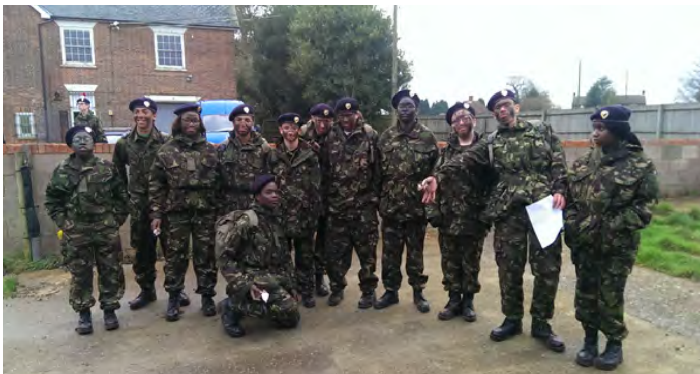
Platanos College Army Cadets