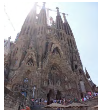
La Sangrada Familia