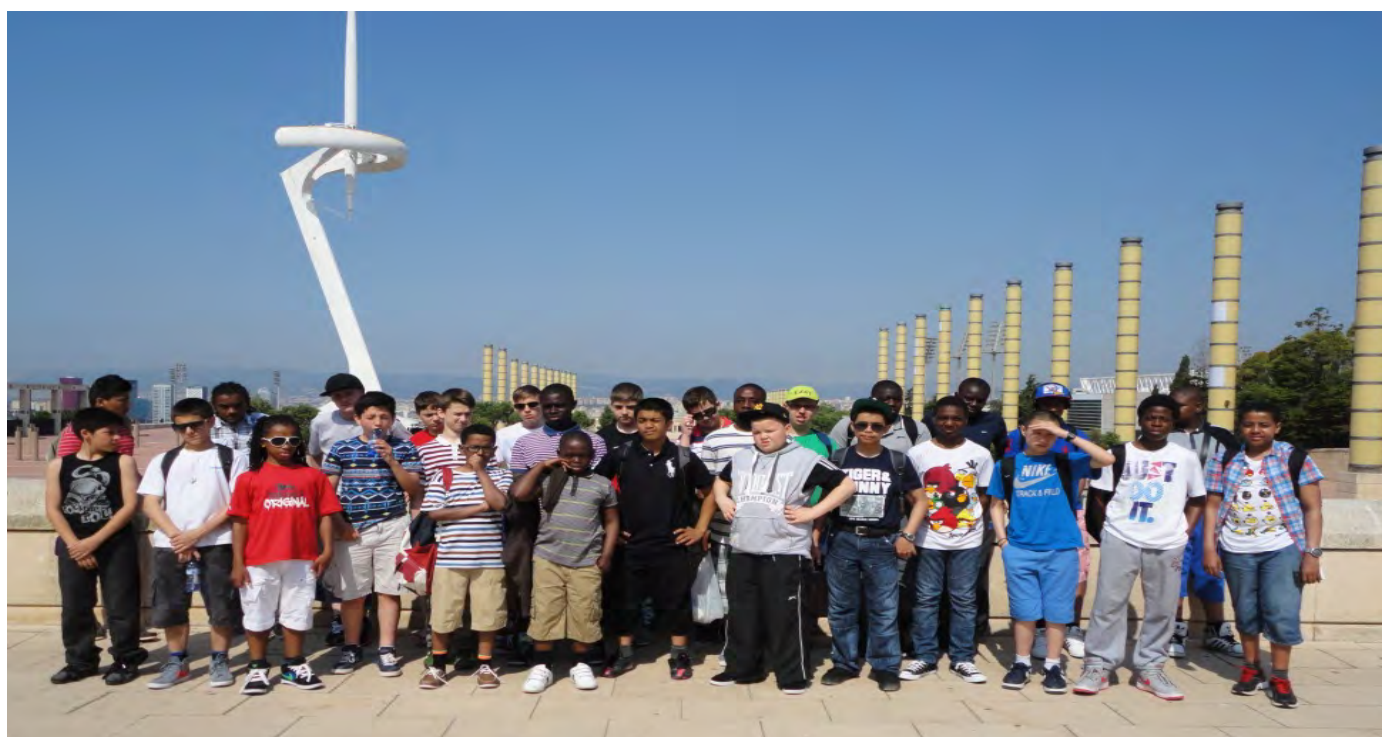
Platanos pupils at the Olympic Stadium in Barcelona

The weather was hot and sunny all week and pupils had a very enjoyable and rewarding experience. Upon their return pupils rated the trip 9 out of 10. In July 2014, there will be another trip for boys and girls to Barcelona.