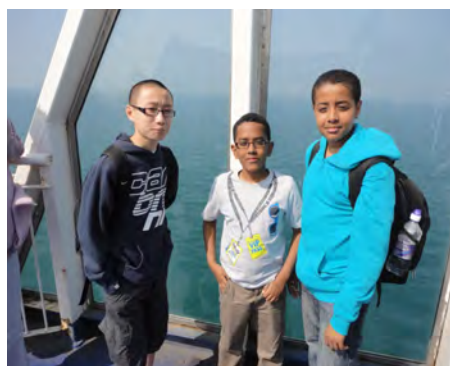
On the ferry