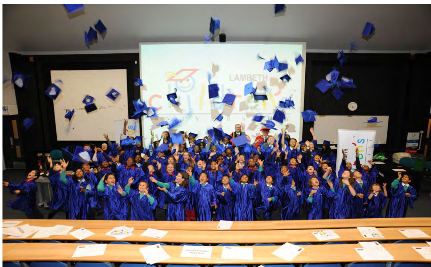
Pupils celebrating after the ceremony