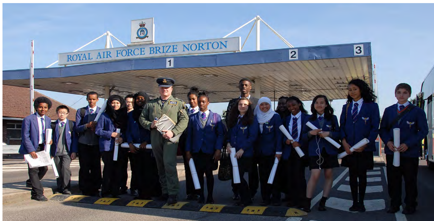
Pupils at RAF Brize Norton

Platanos College pupils had the wonderful opportunity to attend an educational trip to the Royal Air Force in Brize Norton, Oxfordshire. The trip was jointly organised by The Worshipful Company of Fuellers and RAF Brize Norton.