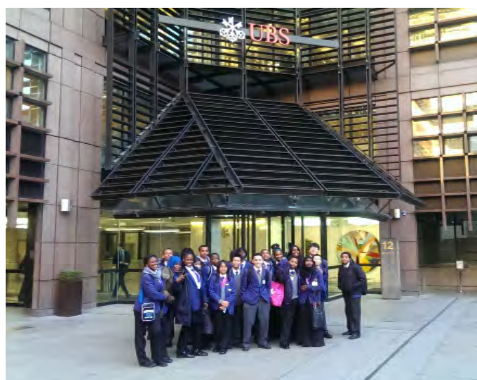
Gifted and talented pupils outside UBS

Through meeting and working with UBS employees, pupils were encouraged to re-evaluate and explore their preconceptions of the City.