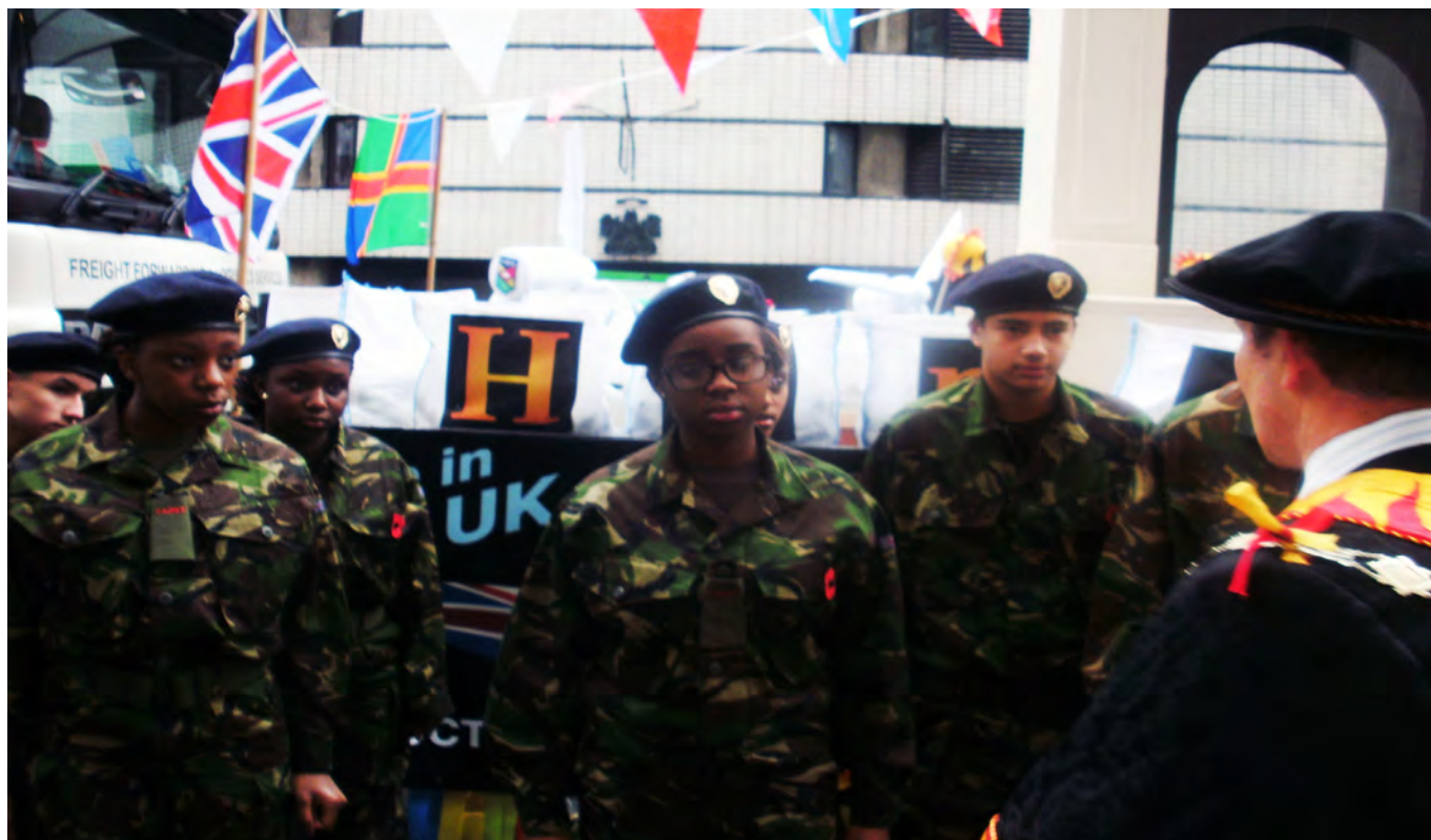
Cadets receiving a briefing before the parade

The Lord Mayor's Show is a prestigious annual televised event to welcome the new Lord Mayor and mark the beginning of her year in office. There were more than 2,000 soldiers, sailors, airmen and cadets and the mounted branch of the City of London Police Force present.