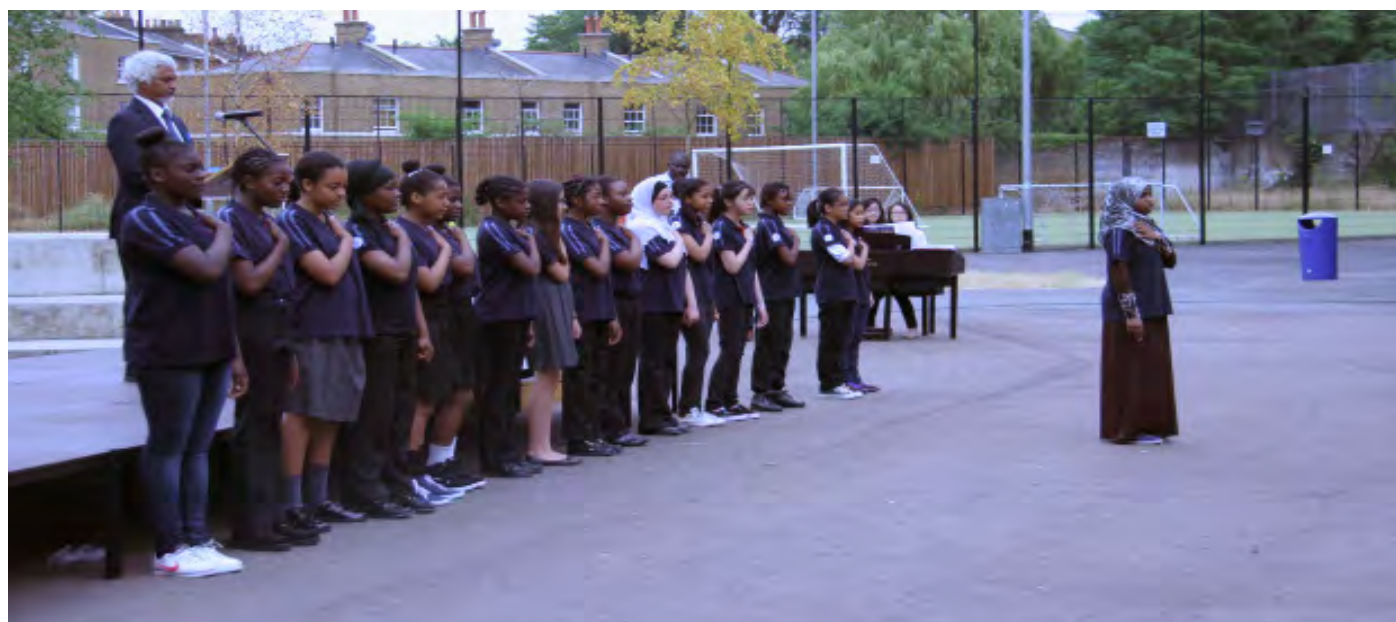
The Platanos Girl Guides at Parade Day