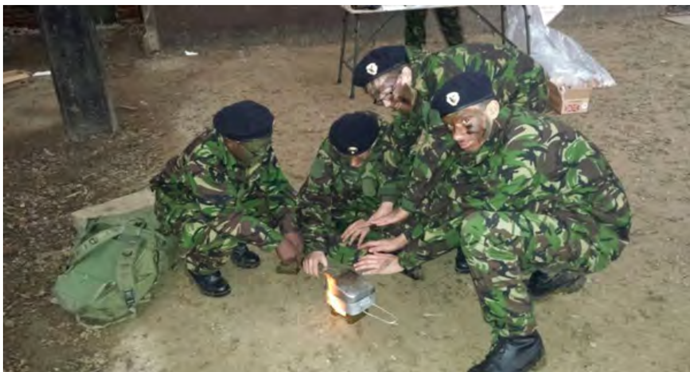
Army Cadets enjoying some warmth whilst waiting for their rations to cook

Over the Autumn term the cadets have been practising drills and learning skills at arms. They were also taken on a field day where they learnt key skills including: how to apply camouflage cream, how to patrol, how to set up a basher (sleeping shelter), how to pack a Bergen and how to cook rations on a hexi stove. The cadets will be using these skills when they go on their first cadet weekend in May 2014.