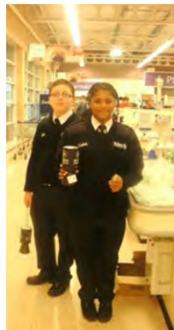
SJA Cadets fundraising