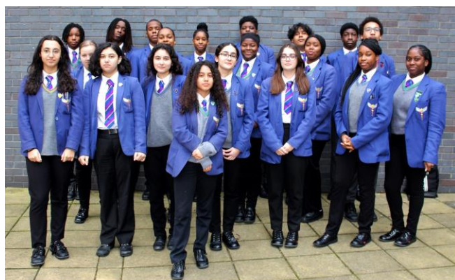
Prefect Team 2021- 2022

At Platanos College, we place great importance on developing young leaders and whole-heartedly value the work of our pupil leadership team. We appreciate that many of our young people have outstanding leadership potential and, throughout their school career, we provide the opportunities for them to develop