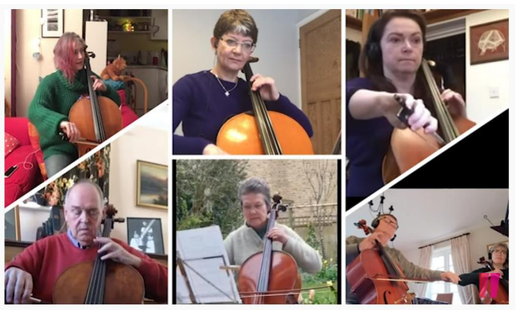
#ClapForOurCarers #ENBPhilharmonic #OurNHSPeople Play For Our Carers: remote Raymonda score excerpt | English National Ballet Philharmonic

https://www.youtube.com/watch?v=5n6X5H BEYCQ&utm_source=wordfly&utm_mediu m=email&utm_campaign=MARENBatHome %233GP04.20&utm_content=version_A