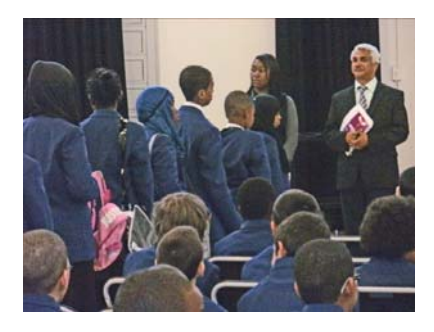
"I got up extra early so that I would be on time."