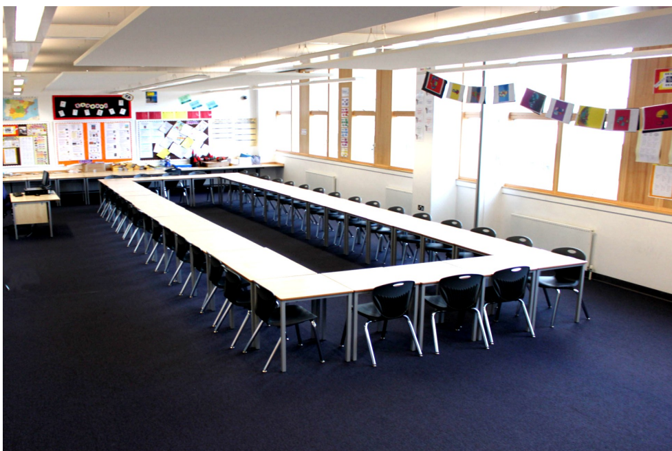
Seminar Room 1 and 2 combined