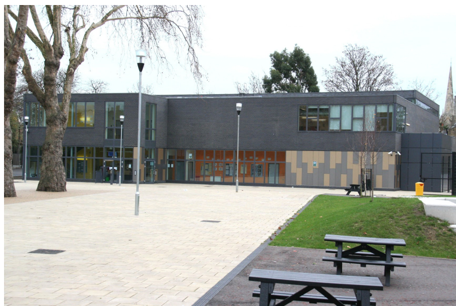
New state-of-the-art Sports Centre