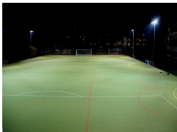
Multi-Use Outdoor Games Pitch