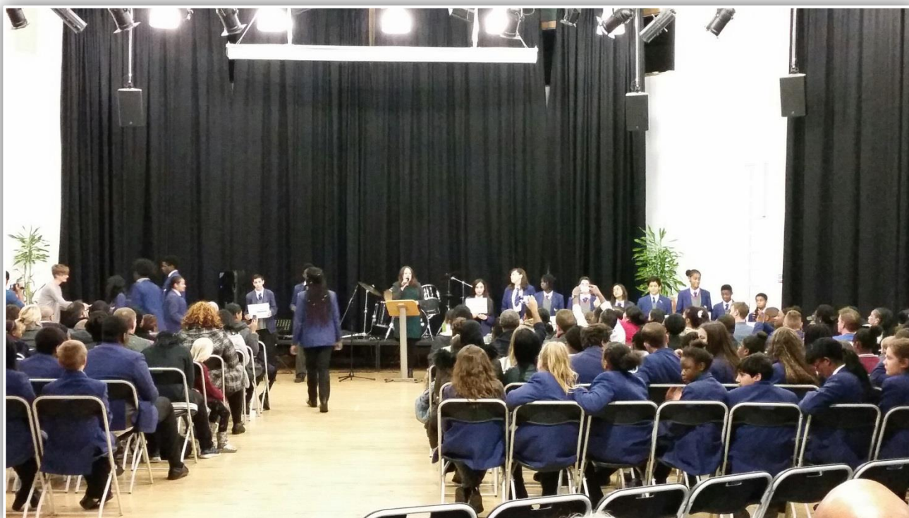
Foundation Awards Ceremony 2015