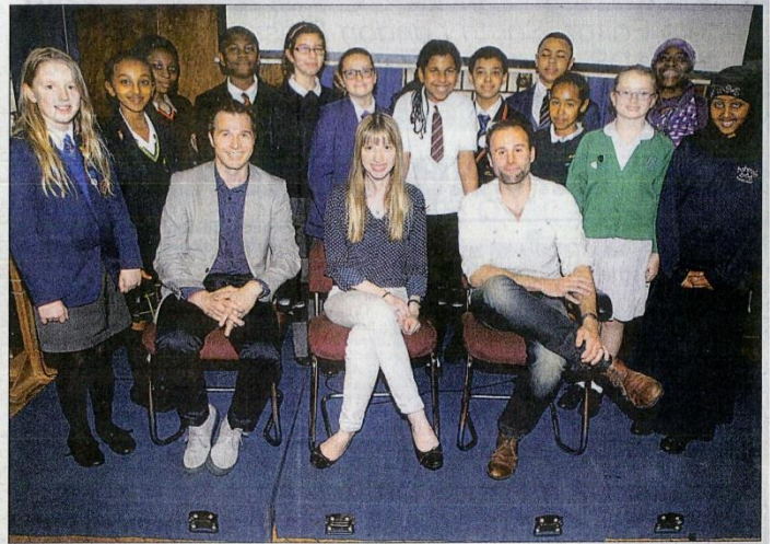
Two Platanos College pupils amongst the young readers and three authors at the Phoenix Book Award 2014