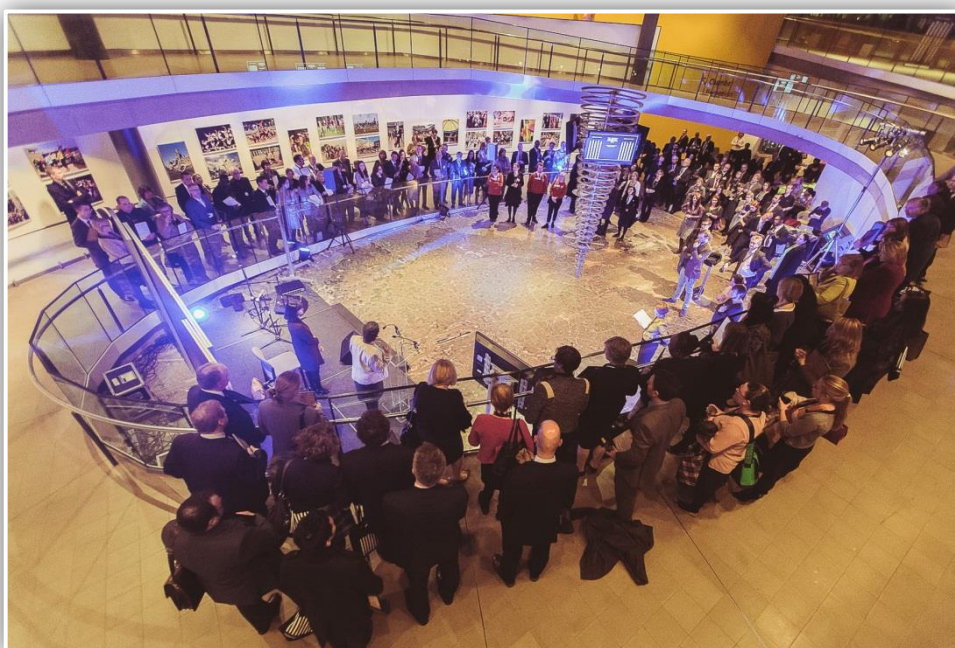
The Mayor's London Schools Gold Club Awards Ceremony at City Hall

The award was presented to the school at The Mayor's Education Conference at City Hall by The Mayor of London.