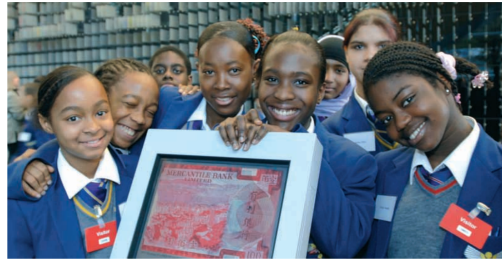
The pupils visiting HSBC were all Chief Executive award winners from the school's innovative Portfolio for Life Programme.

"Being awarded the CBE is a great honour for the school and for me personally. This is the result of the hard work of the staff and pupils in the school as well as the immense support from the Governors. We still continue to focus on the basic areas of numeracy, literacy and good behaviour".