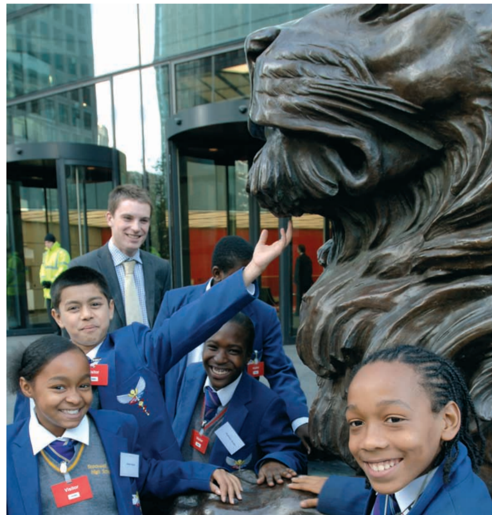
Pupils get a taste of the corporate world when they visited HSBC's magnificent Head Office in Canary Wharf during Enterprise Week.

In addition, pupils are taught the skills they'll need to succeed in the world outside of school.